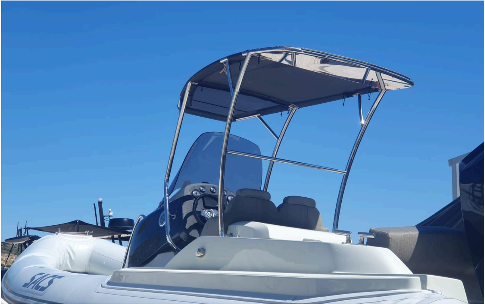
STRIDER 900 2023