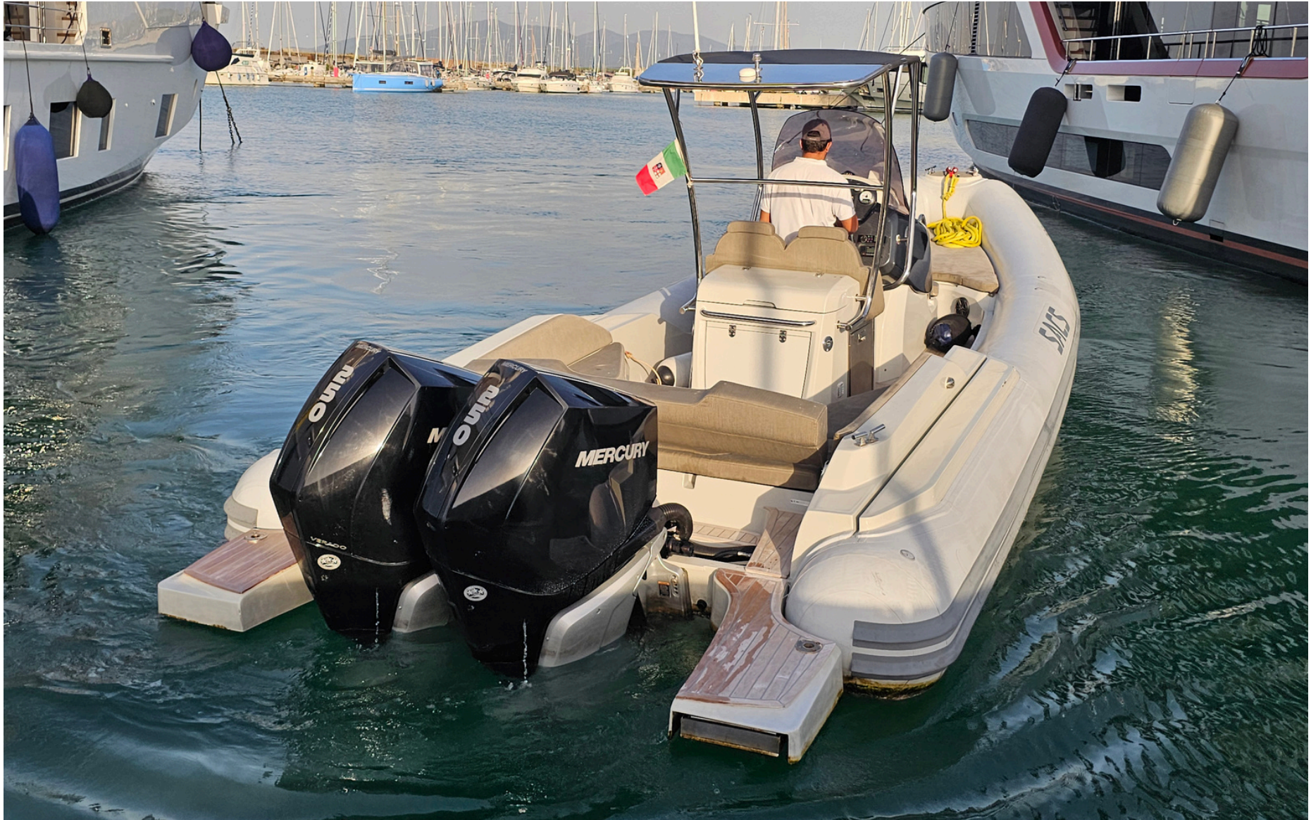
STRIDER 900 2023