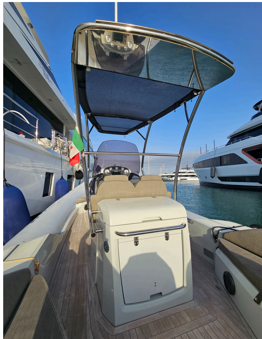
STRIDER 900 2023