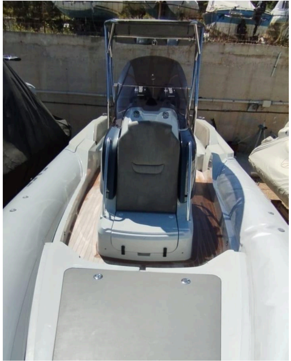
STRIDER 900 2023