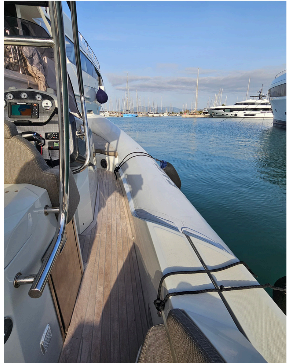
STRIDER 900 2023