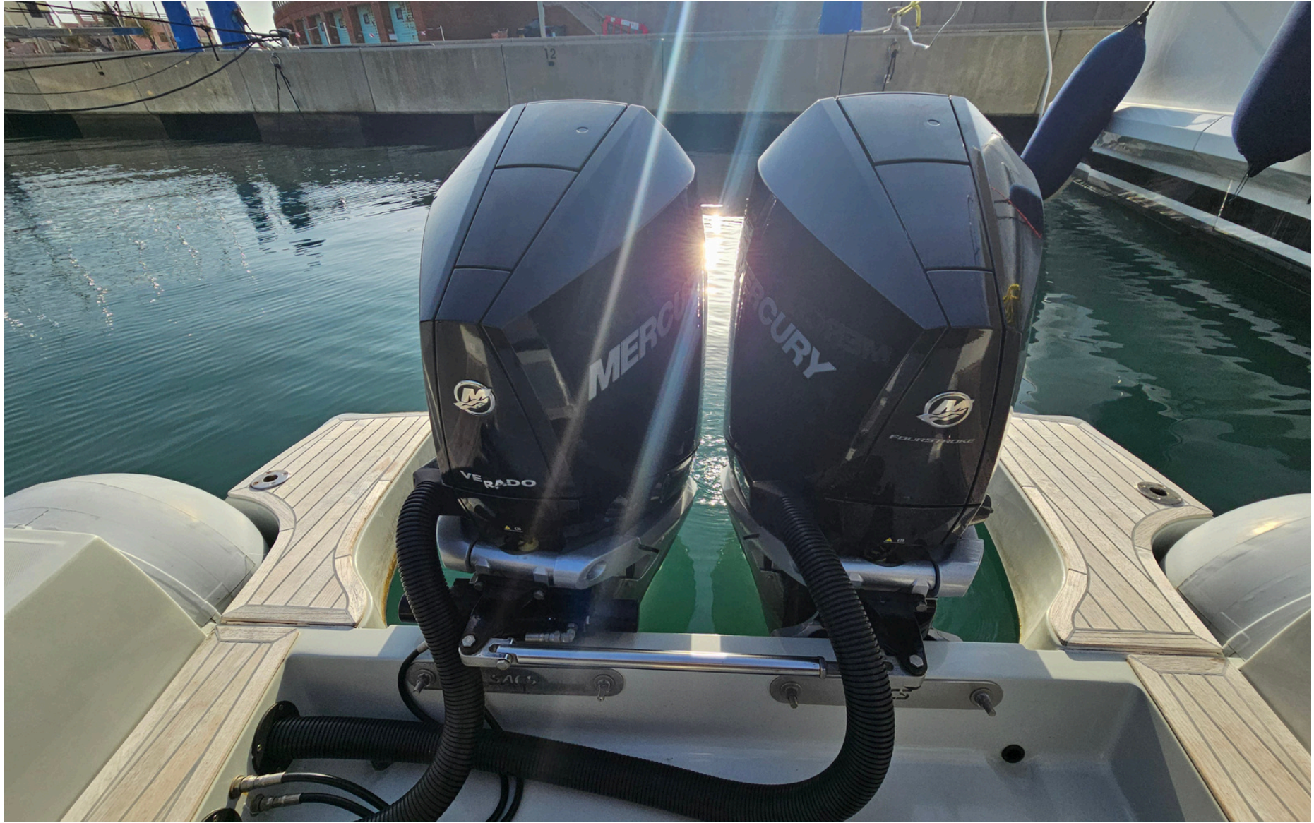
STRIDER 900 2023