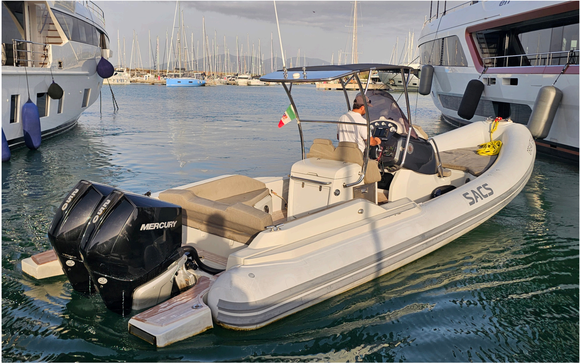
STRIDER 900 2023