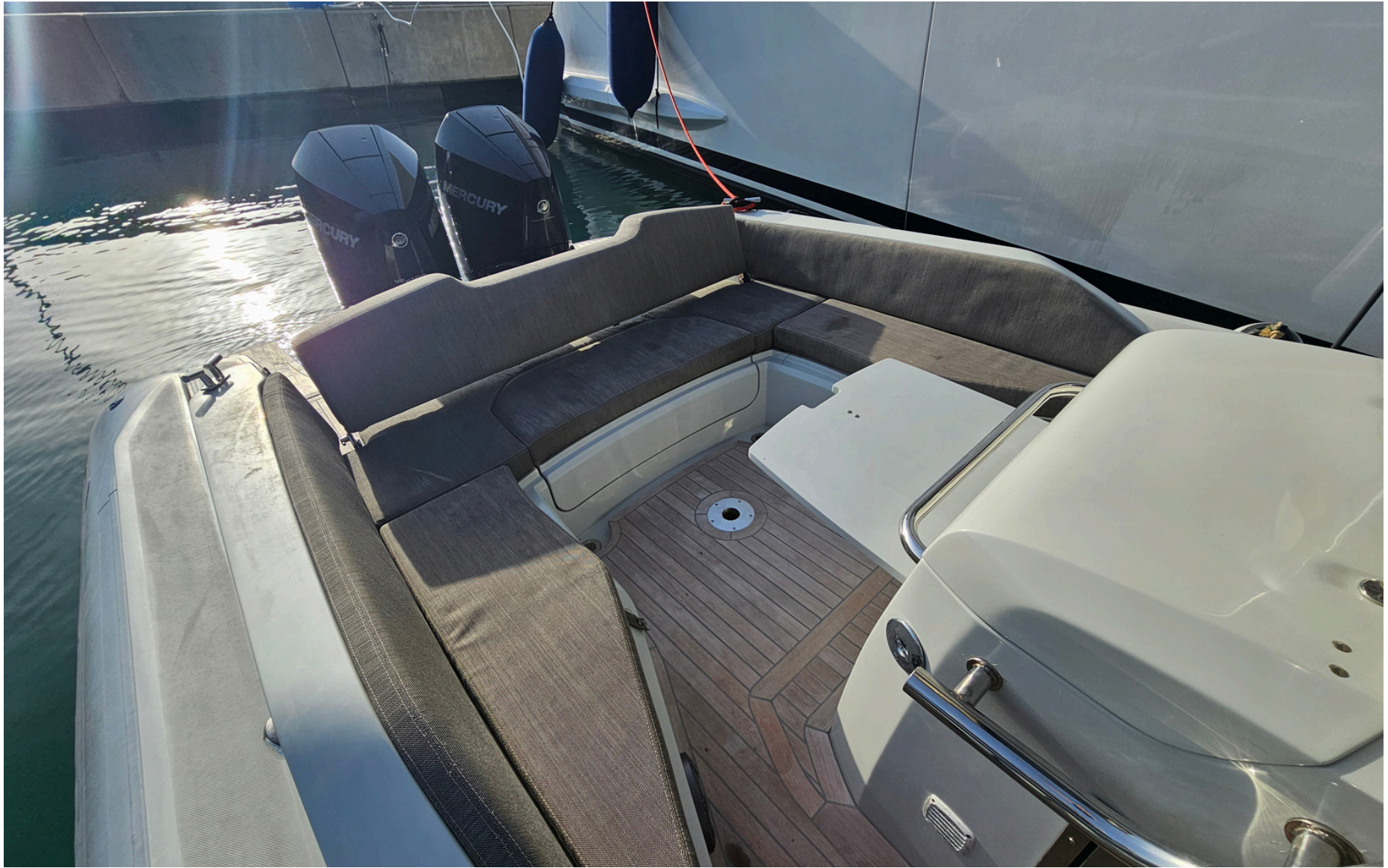
STRIDER 900 2023