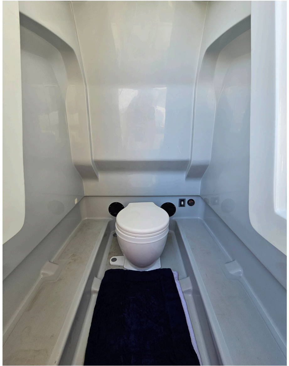
STRIDER 900 2023