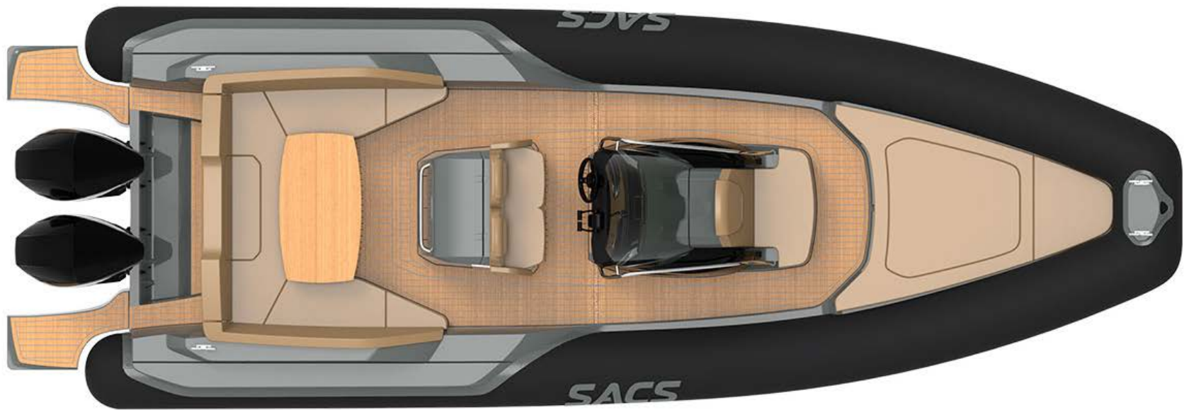
Layout - Deck