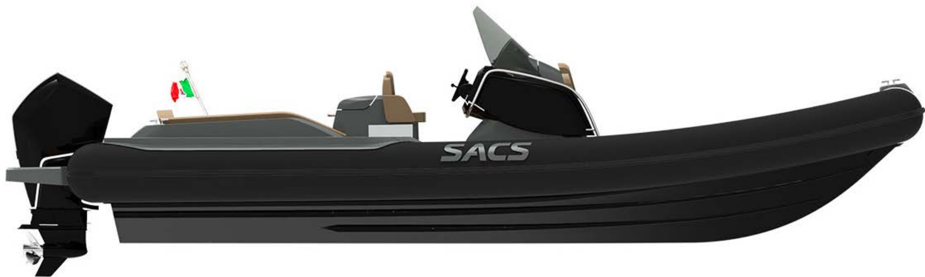
Layout - Side