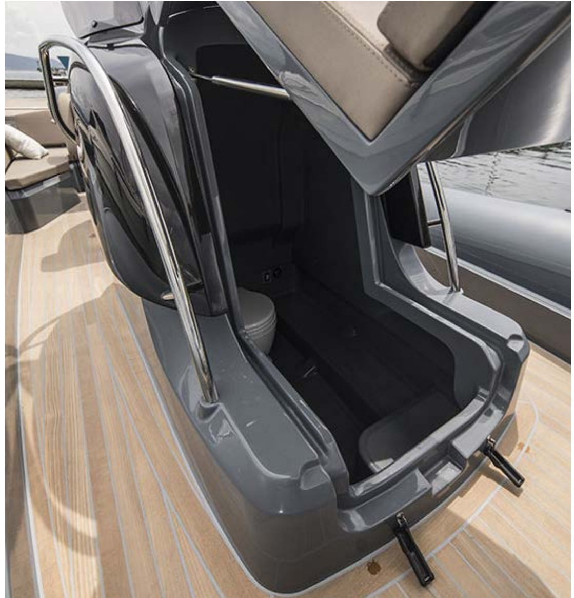
Cabin Under Console