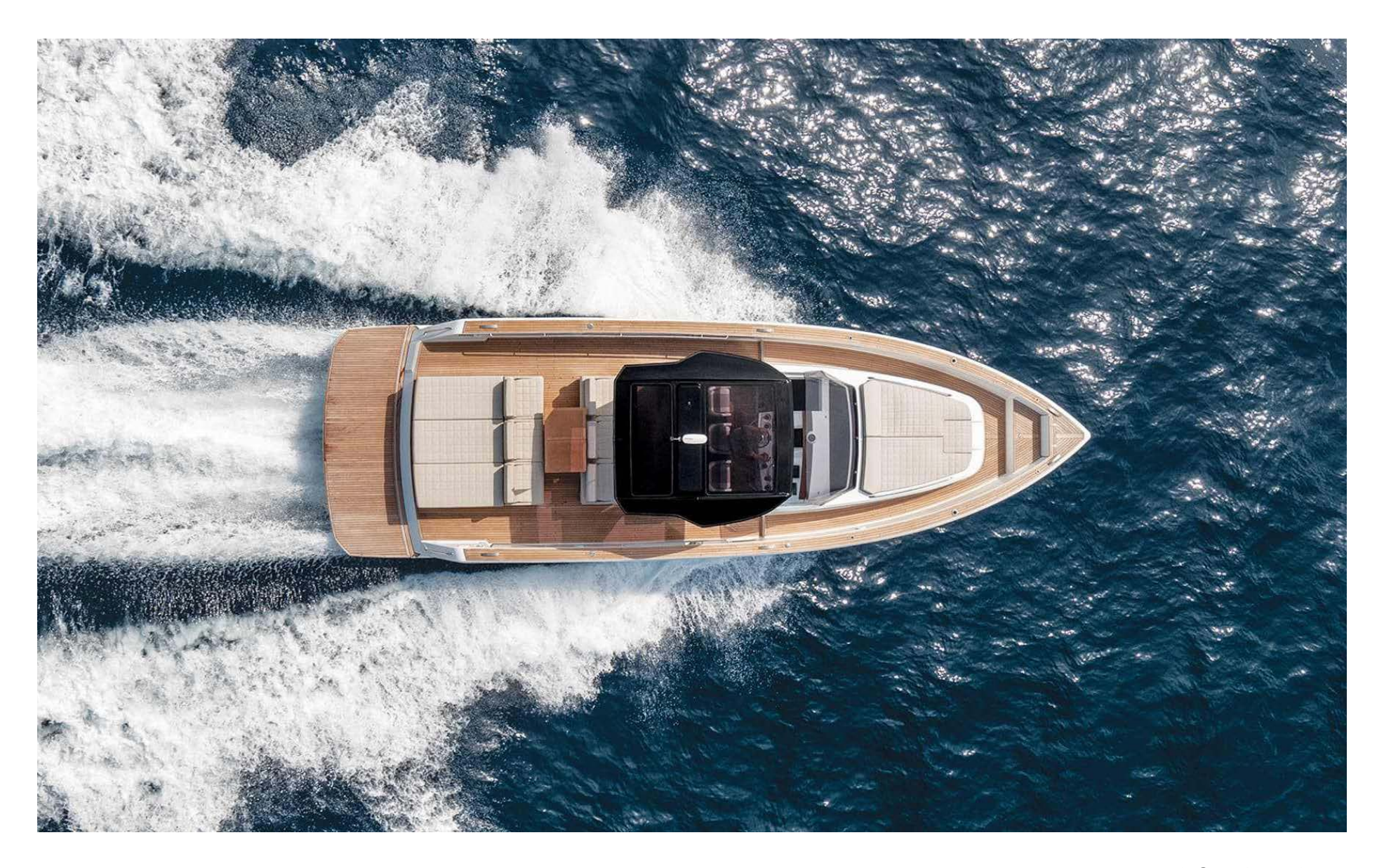
* Catalog photo