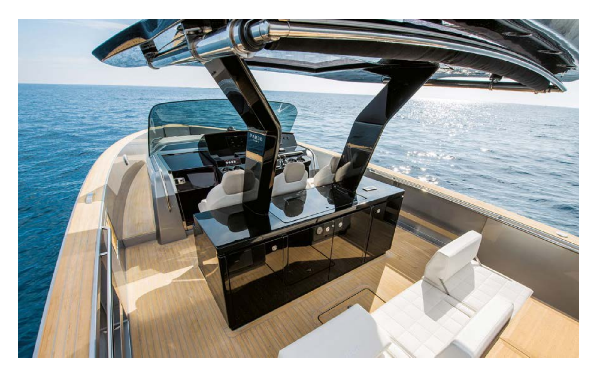
* Catalog photo