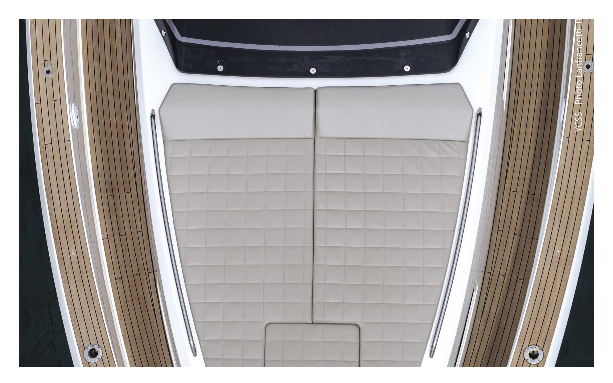
* Catalog photo