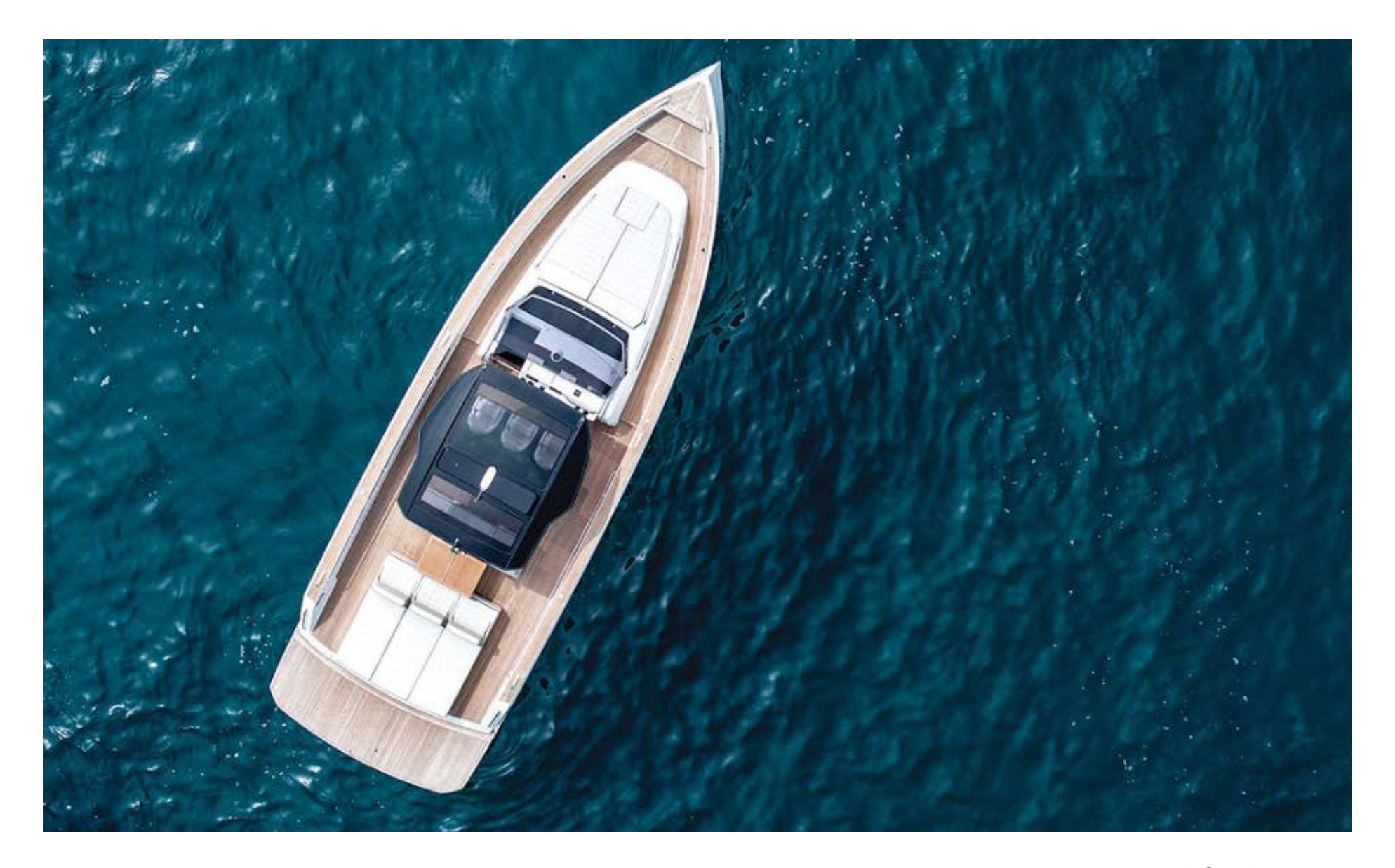
* Catalog photo