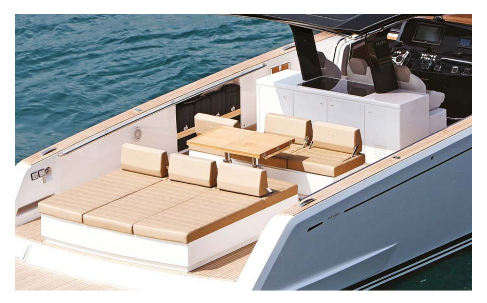
* Catalog photo