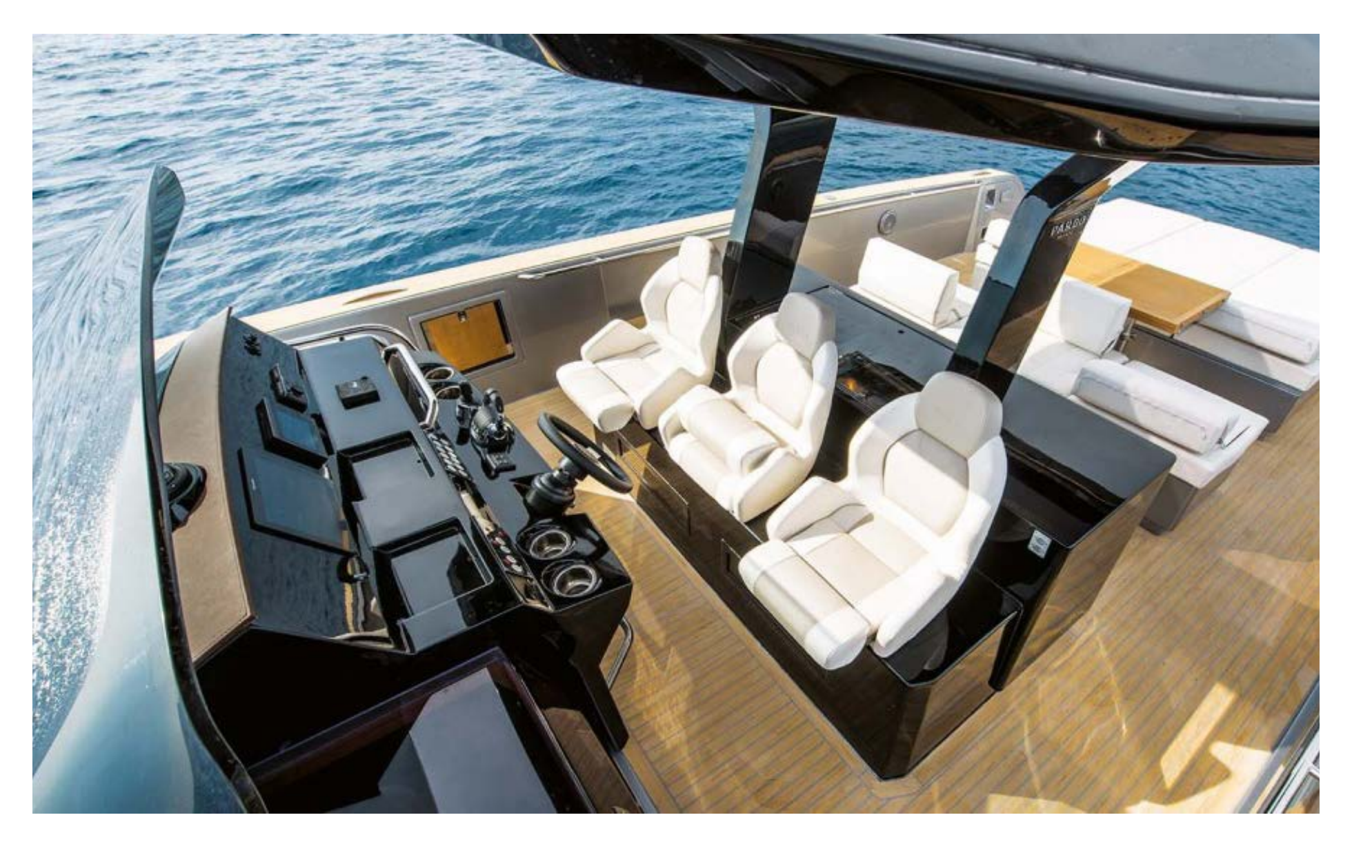
* Catalog photo