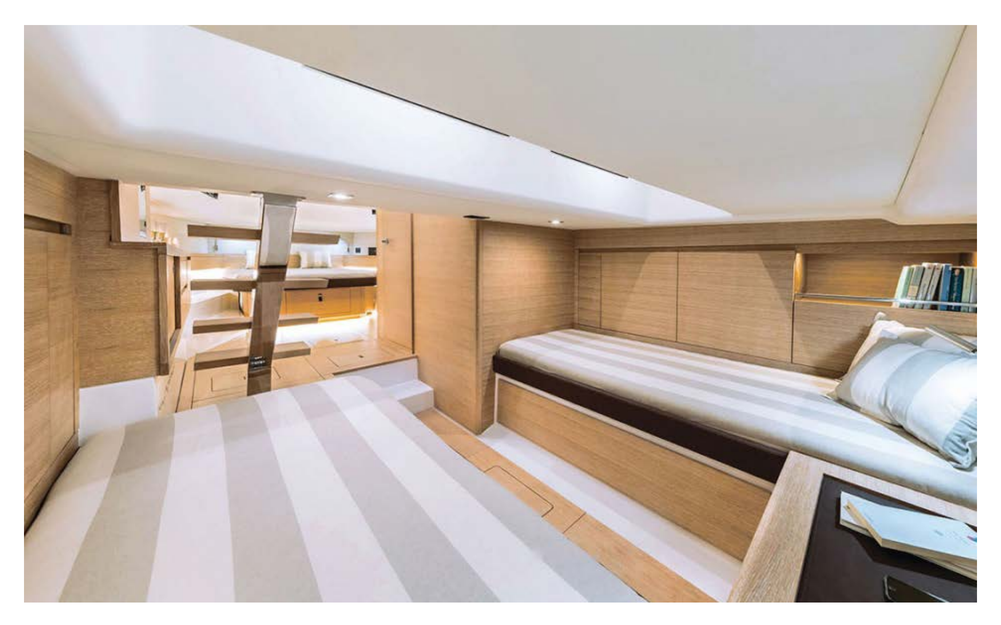
* Catalog photo