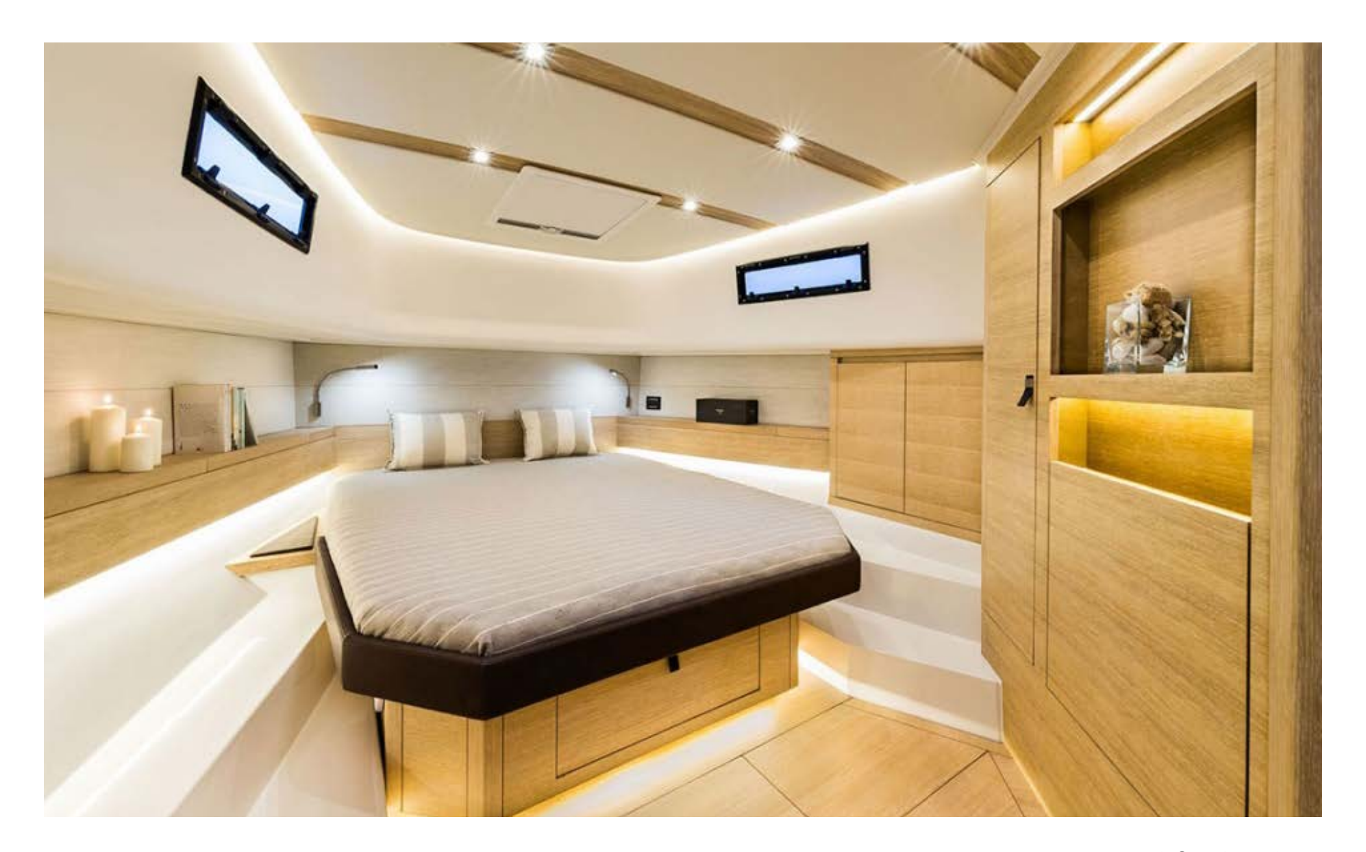
* Catalog photo