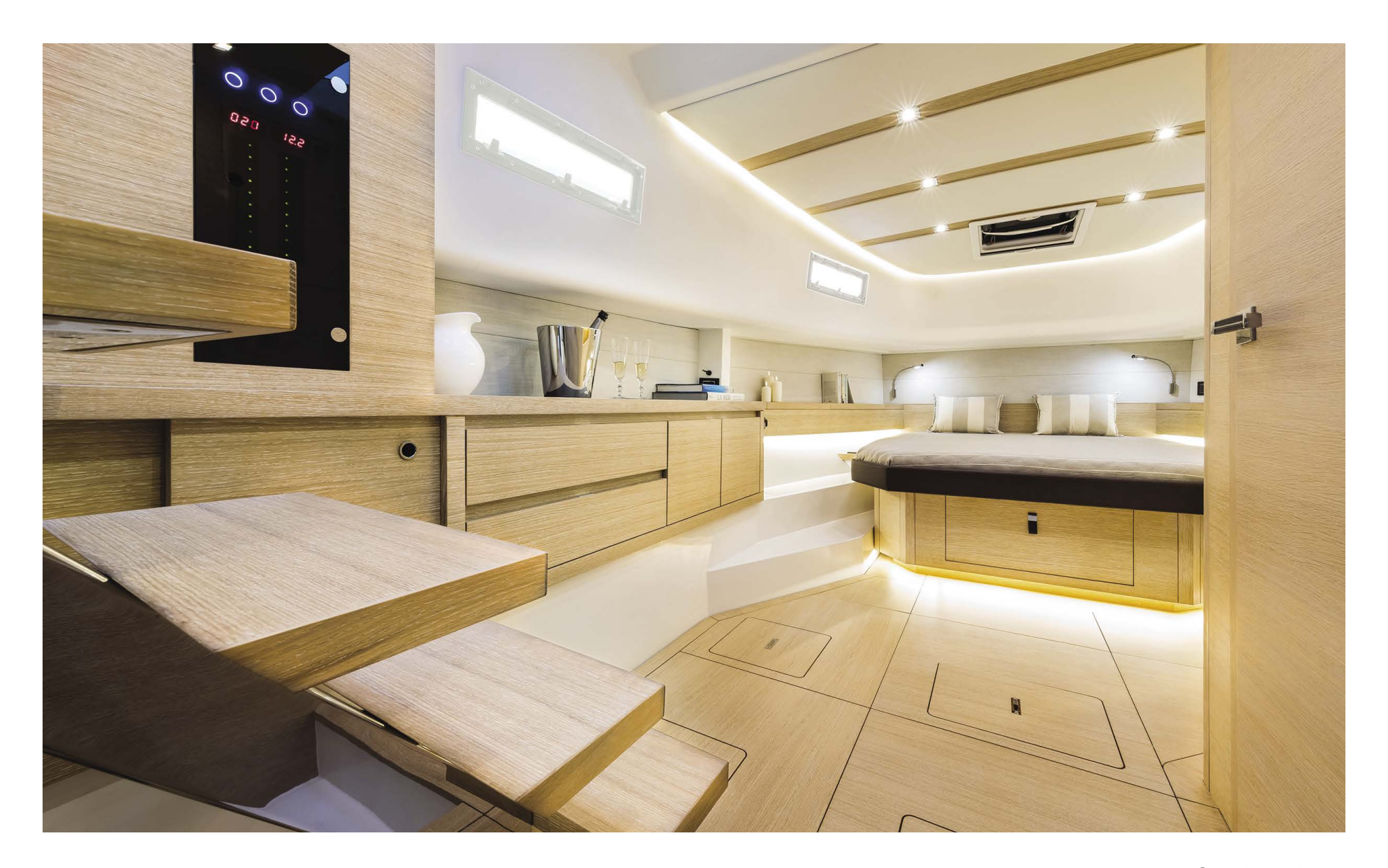
* Catalog photo