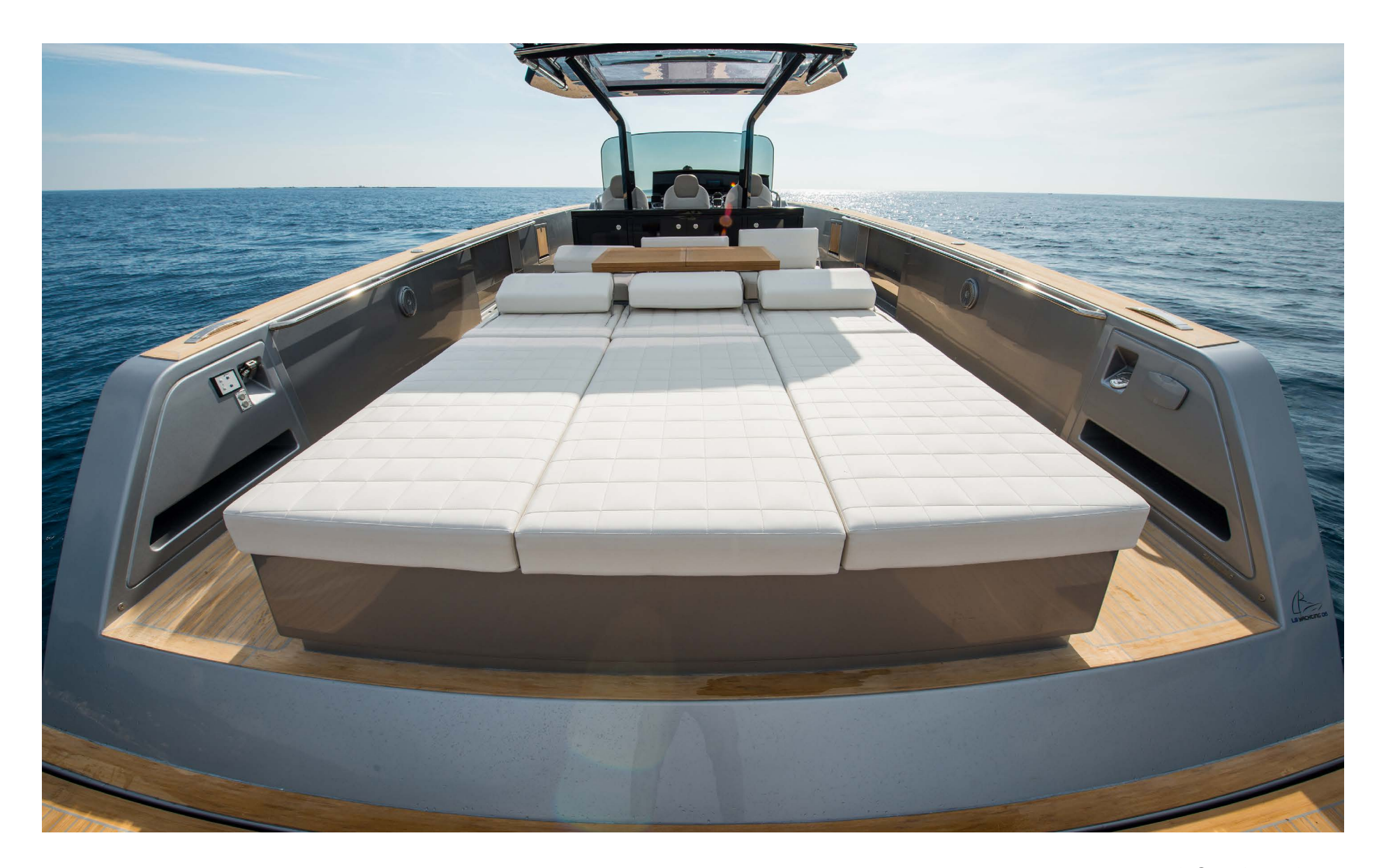
* Catalog photo