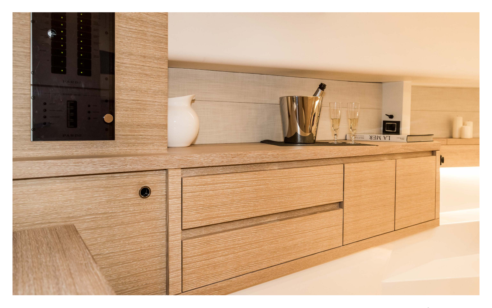
* Catalog photo