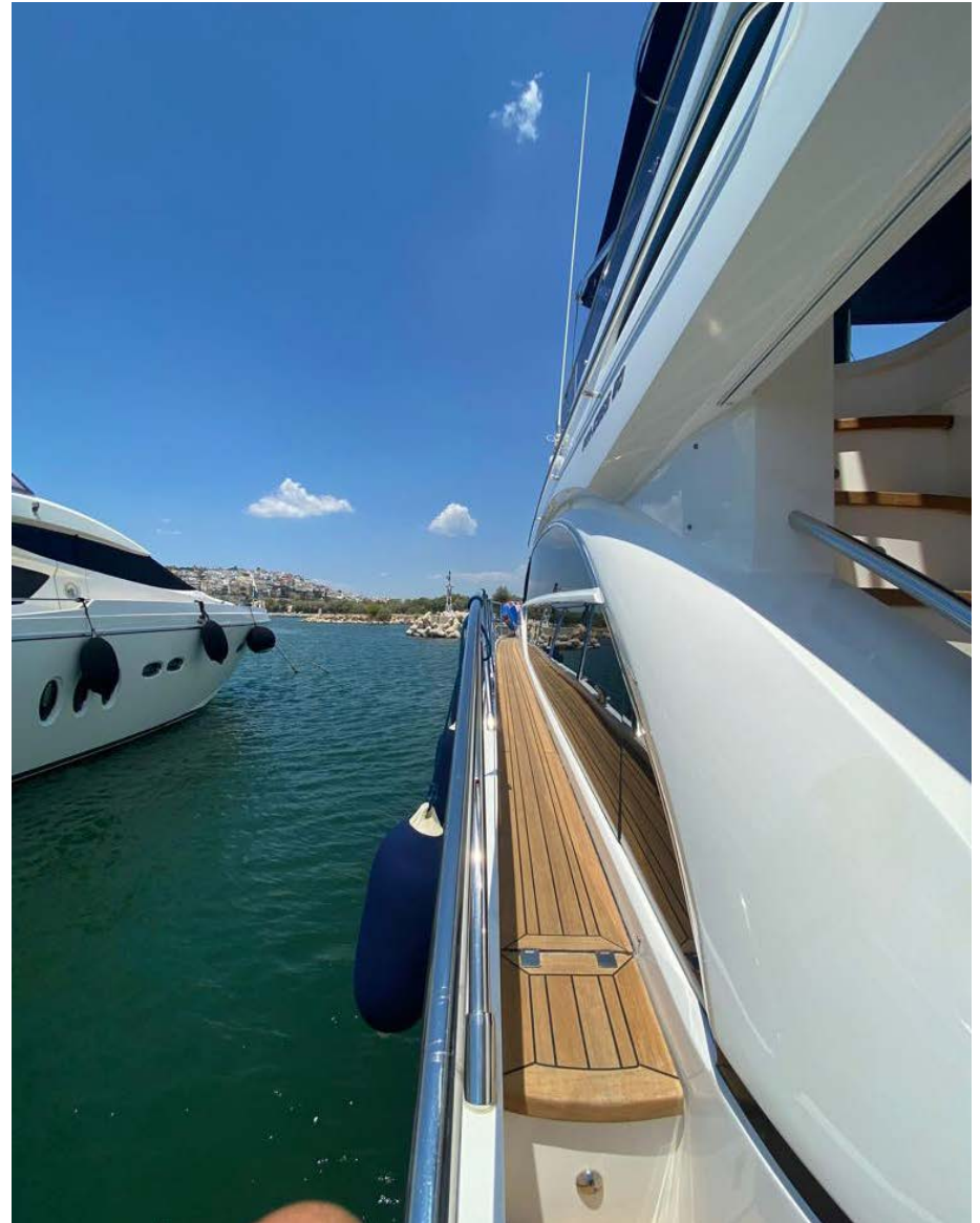
Starboard & Portside