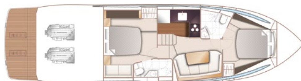
LOWER DECK - OPEN