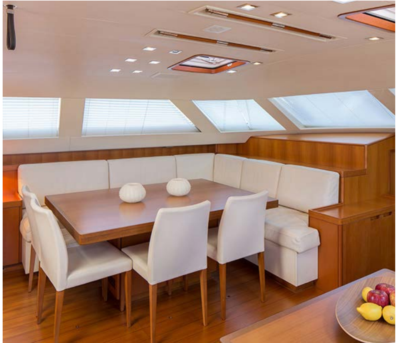
Saloon & Galley